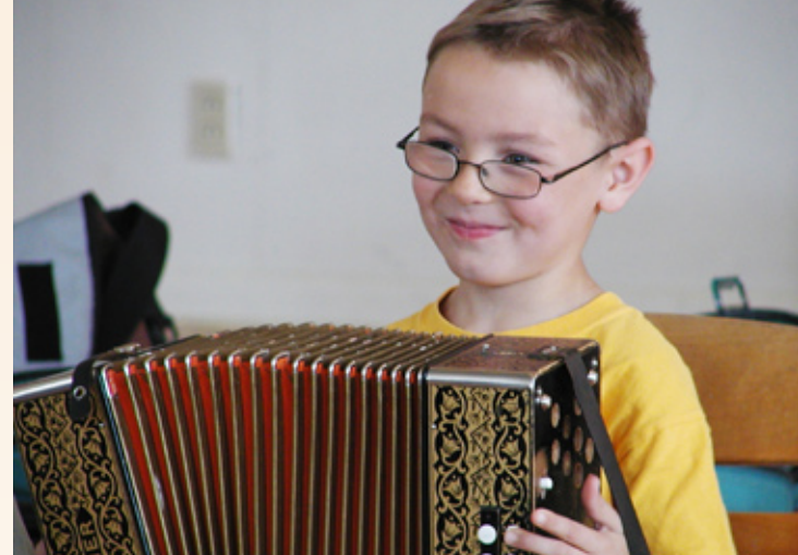
Student participating in a music residency at Bynum School.