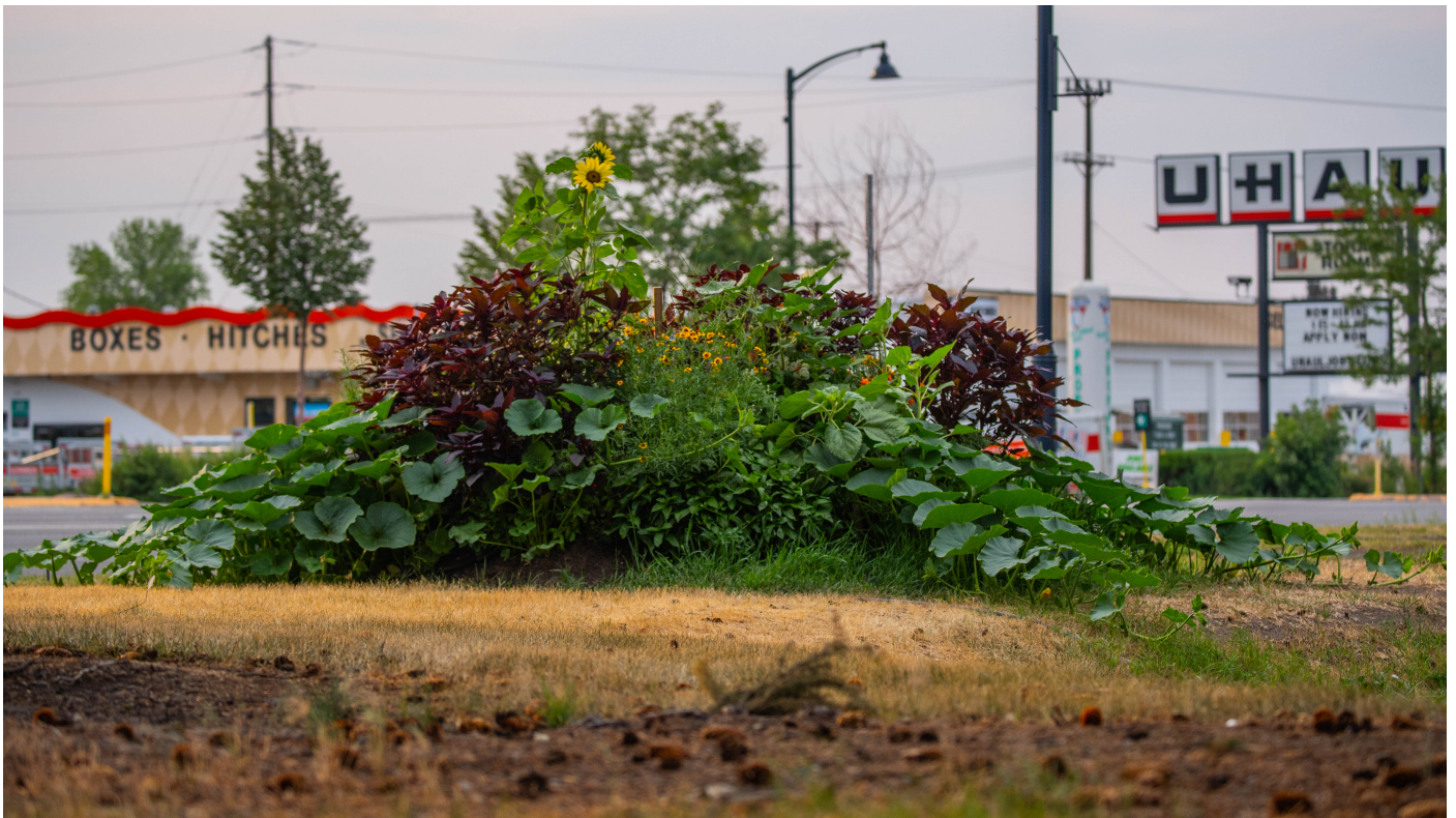
Chromatic Botanic Garden, wool mound with dye and fiber plants, 2021, 16'x16'x10' A living, growing sculptural garden that acts as a regenerative and pollinator friendly source of color. Located on N. 7th ave in Bozeman, MT