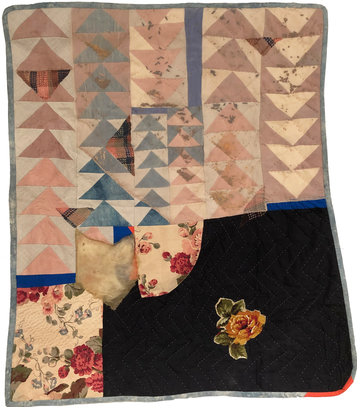
Moving Blanket, seeds, botanically dyed linen, vintage cotton, 2019, 50"x64" The iconic moving blanket but remade entirely from plant material including sachets of seeds and botanically dyed "flying geese" quilt blocks of linen. This quilt comments on the pejorative perspective of early philosophers who that argued that plants lacked agency to move, therefore, they did not deserve a position higher up on the Great Chain of Being