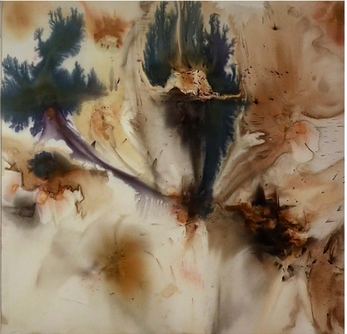
Eveline and Twilight, 2021, metal salts and botanical dyes on silk, 3'x3' Silk soaked in mine tailings and dyed with plants and botanicals