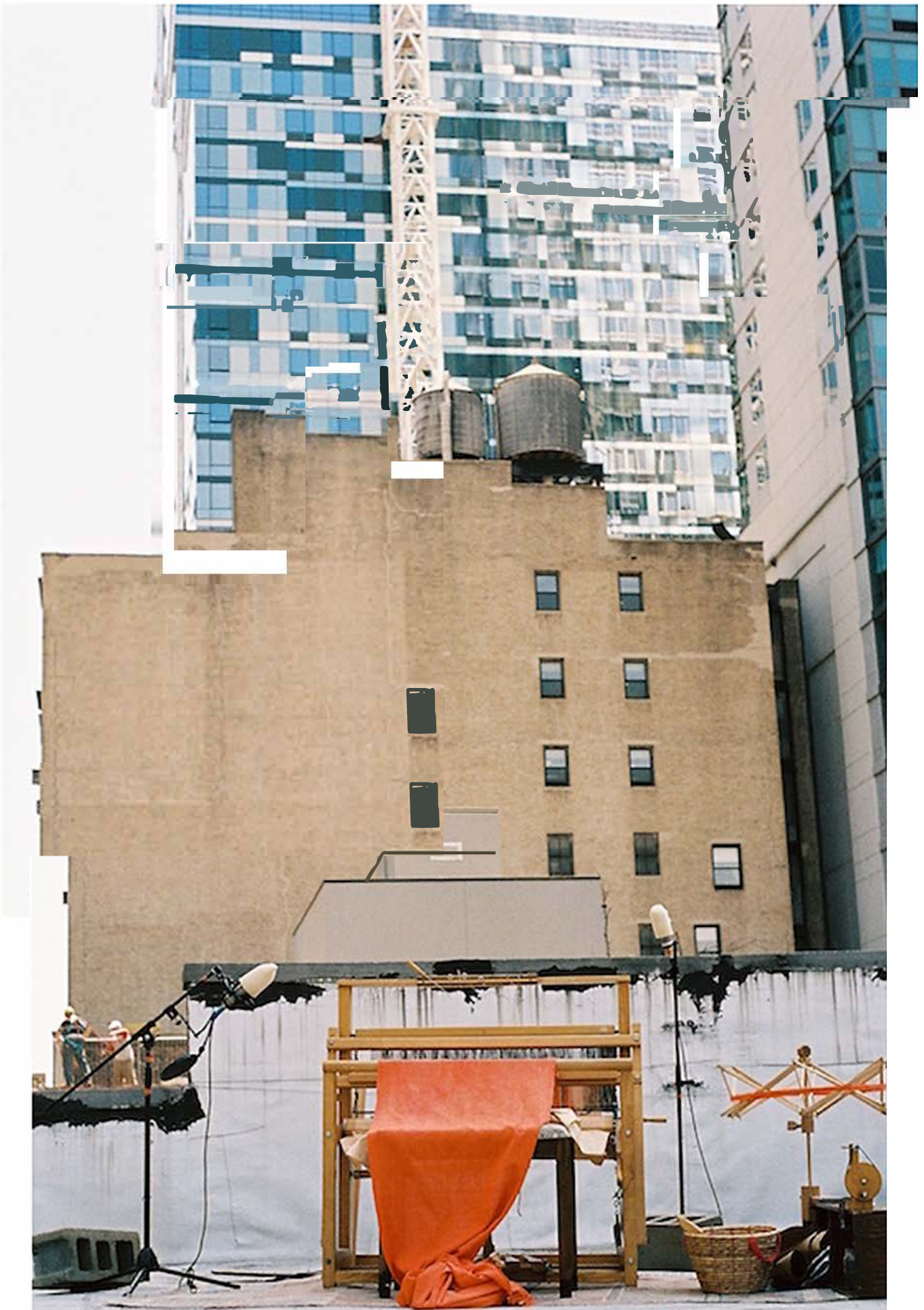
WEAV FM morning edition, 5:40:18 of audio recording and 6 yards of woven cotton cloth, 2015. A durational, site specific weaving performance that mixed the soundscape of Brooklyn, NY with the voice of my working loom and broadcasted it live on a hyperlocal FM station. Audio archive available at https://goo.gl/nj2CEW