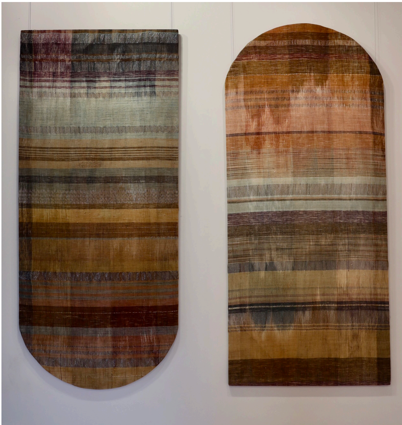
Plant Portal and Time, 2021, metallic yarn and cotton yarn dyed with metal salts and botanical dyes, 7'x3.5' each. Two handwoven panels made with cotton yarn mordanted with metal salts collected from four abandoned mines and dyed with plants and botanicals