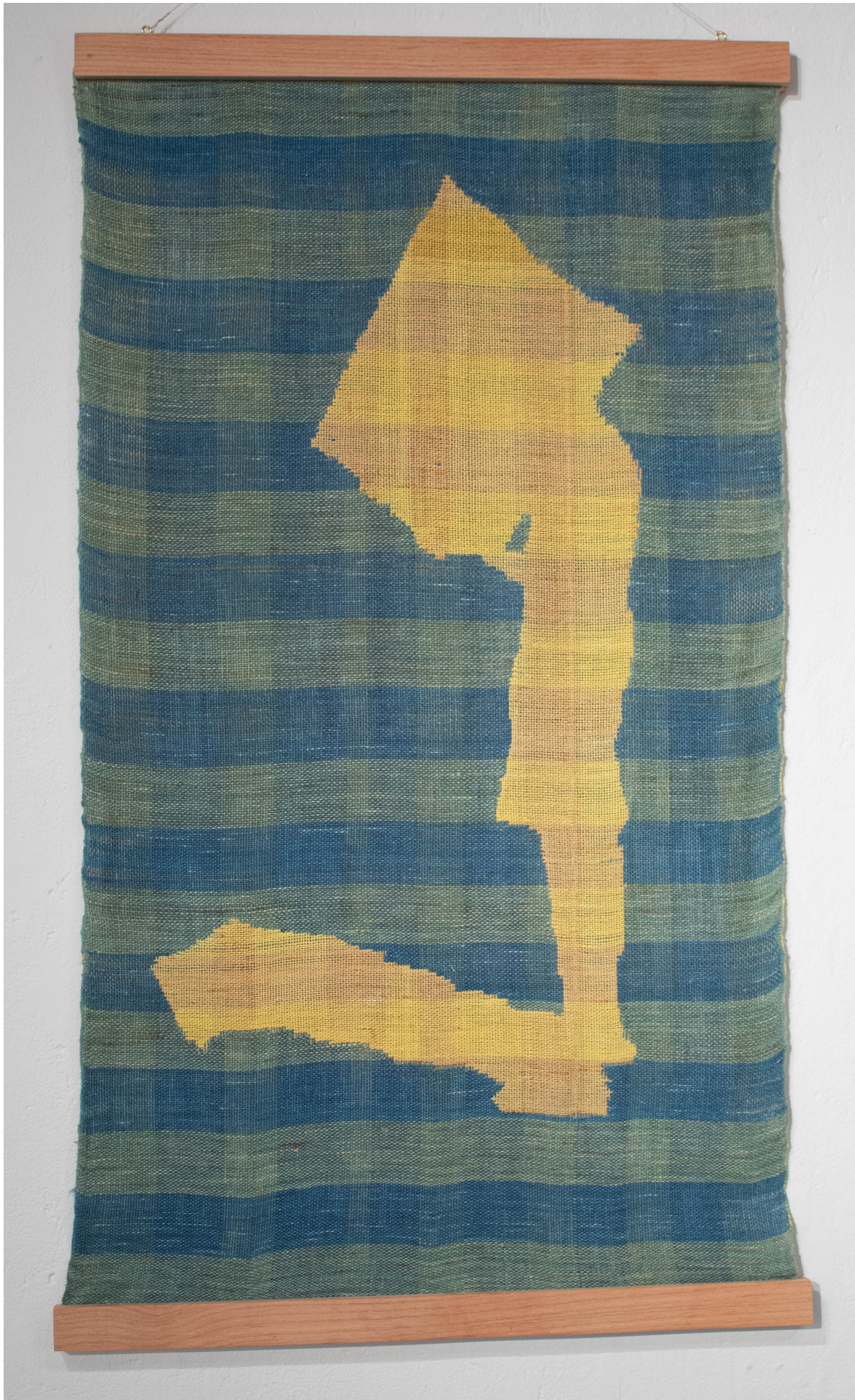
Totality, Handwoven naturally dyed cotton, 2020, 23"x31"

Over 18 hours of labor embedded into this cloth that depicts the two minutes of total eclipse viewed through a cardboard box in 2017. By referencing imagery from the Great American Eclipse, this piece captures a rare and poignant moment of collective stillness and observation.