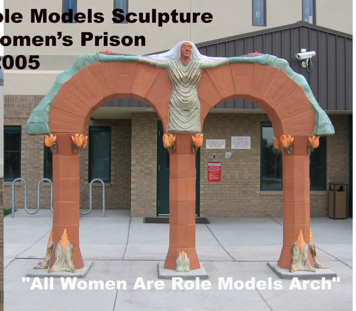
"All Women Are Role Models Arch"