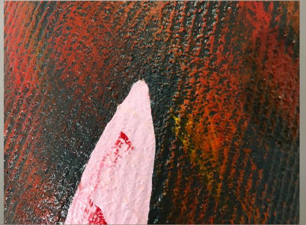
Clawson_14 – Retro – 2021 – 8'h x 2'w x .5' d – Wall-mounted – Rigid foam and acrylic paint.