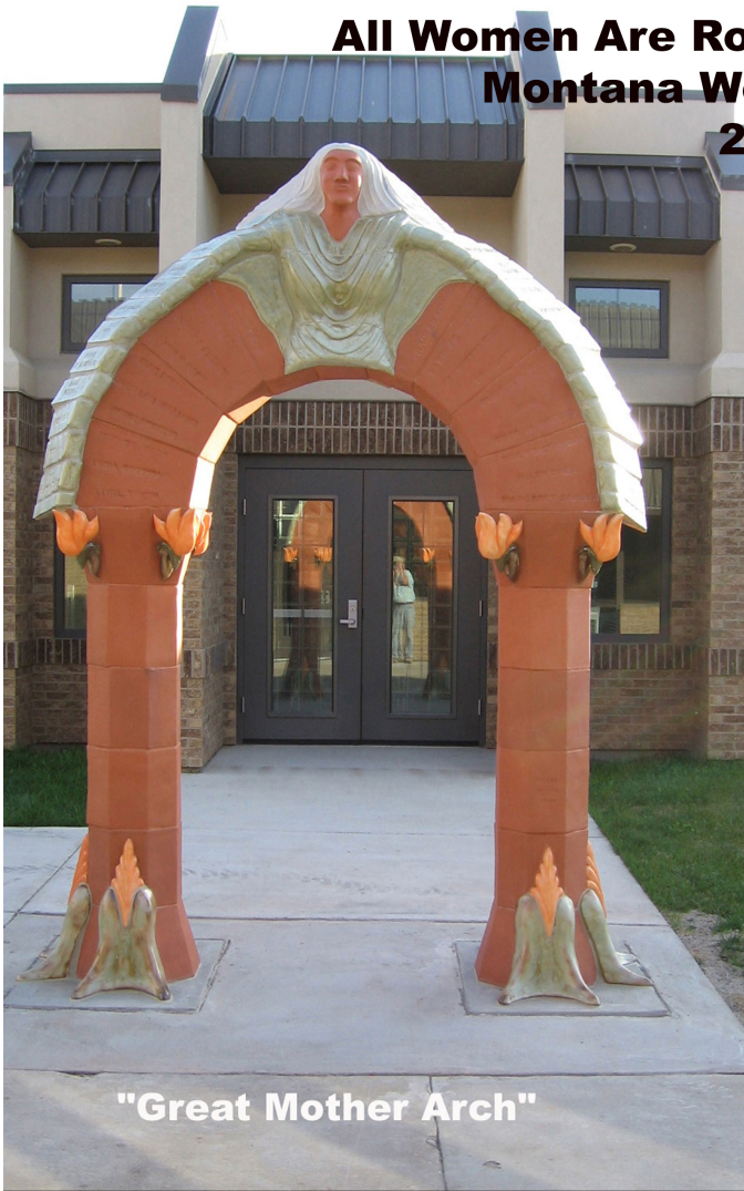
"Great Mother Arch"