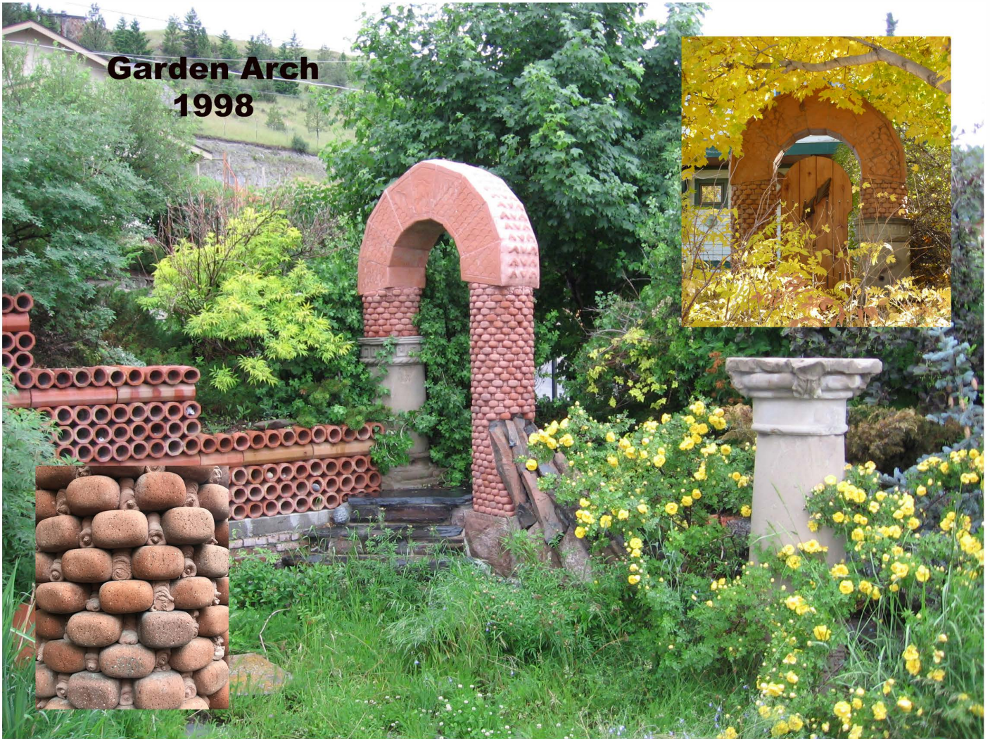
Clawson_01 – Garden Arch – 1998 – Ceramic, concrete and tumbled bricks – 11'h x 12'w x 2'd – Early innovation using hollow ceramic shapes filled with concrete and rebar. Also developed tumbled bricks for this project.