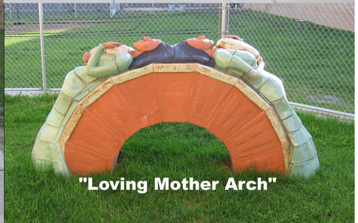
"Loving Mother Arch"

Clawson_ 02 – All Women Are Role Models Sculptures – 2005 – All Women Are Role Models Arch – Ceramic and concrete – 11'h x 15' x 2'd – Great Mother Arch – 11'h x 8'w x 2'd – Loving Mother Arch – 4'h x 8'w x 2'd – More complicated use of hollow ceramic shapes and risk involved when undertaking figurative work on a major project with limited experience with figurative sculpture. These sculptural arches are located at the Montana Women's Prison in Billings, MT (MAC Percent for Art Commission).