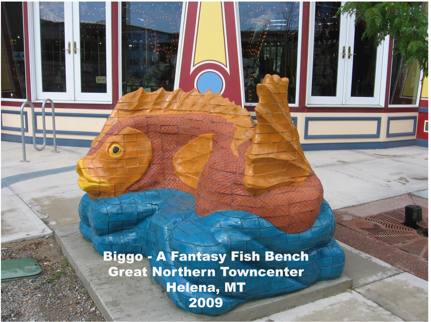
Biggo - A Fantasy Fish Bench Great Northern Towncenter Helena, MT 2009

Clawson_03 – Biggo, The Fantasy Fish Bench – 2009 – Carved bricks and glaze – 4'h x 6'w x 4'd – The risk of a new construction method (carved bricks) on a major project.